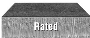
3/8 in. (9.5 mm) at 18 IPM

Note: Recommended maximum piercing capacity for hand-held applications is 3/16 inch (4.8 mm). Maximum sever cut of 5/8 inch (15.9 mm) at 6 IPM.