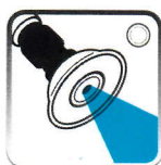
QUICK CONNECT NOZZLE - 40°