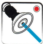
QUICK CONNECT NOZZLE - 0°