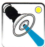
QUICK CONNECT NOZZLE - 15°