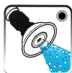
QUICK CONNECT NOZZLE - SOAP